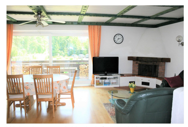
Wohnzimmer mit Kachelofen und Kamin