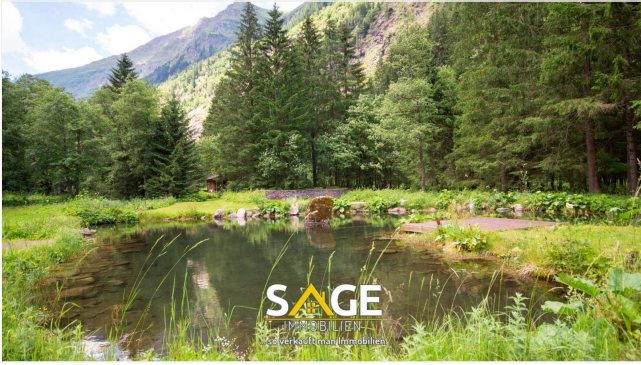
Hotel in Bad Gastein!