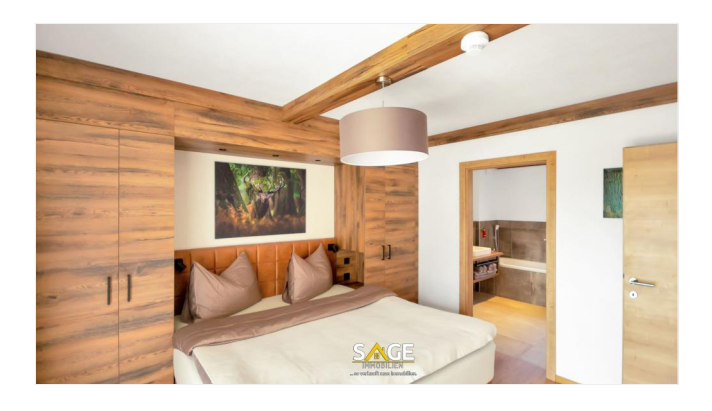
Beispielfoto Schlafen 2