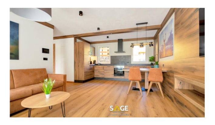
Küche und Essbereich