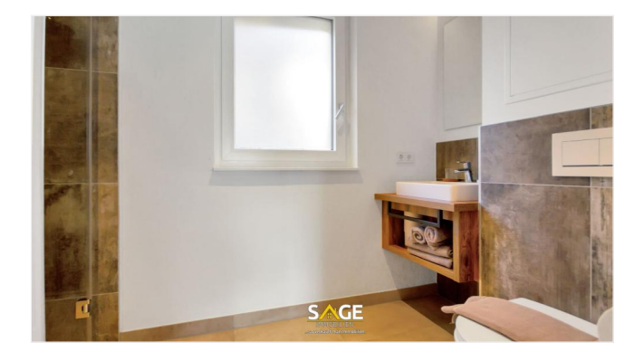
Beispielfoto Badezimmer 2