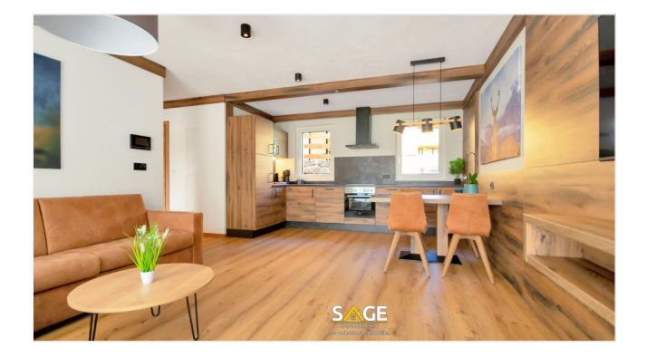
Beispielfoto Wohnen 2