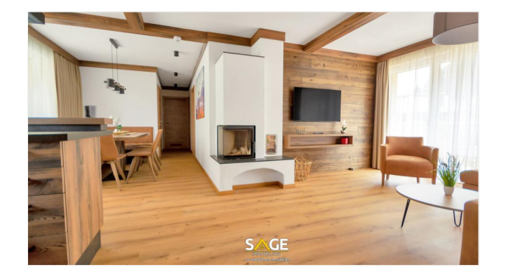
Beispielfoto Wohnen die "Grandiose"