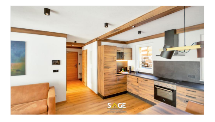
Beispielfoto Wohnen 3