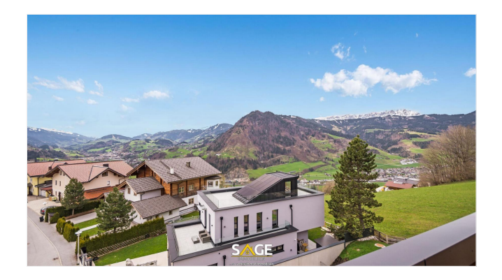
Panorama vom Sonnenbalkon