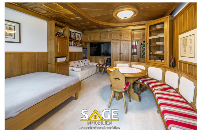
Ferienwohnung in St. Johann