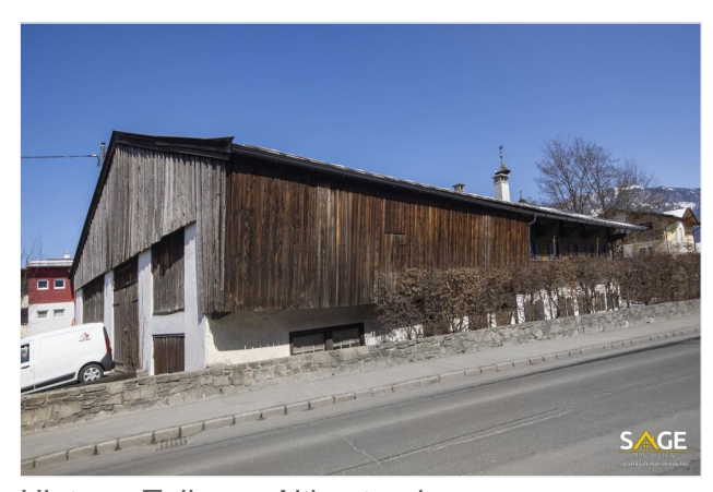
Hinterer Teil vom Altbestand