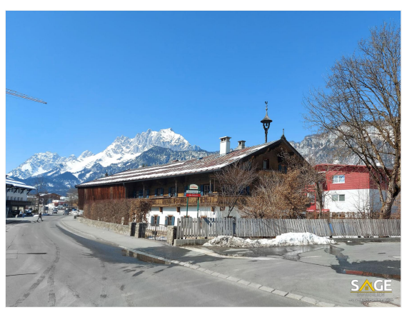
Grundstück mit Altbestand