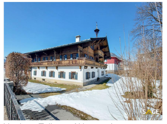
Vorderer Teil vom Altbestand