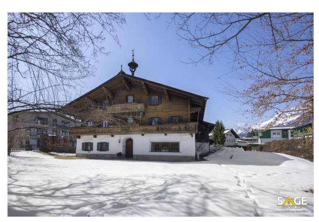
Vorder- und Seitenansicht