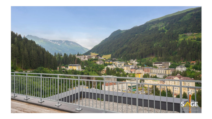
Terrasse mit "Blick"