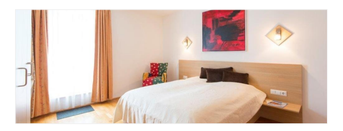
Schlafzimmer mit Balkon