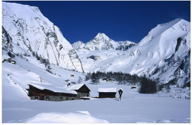
Tourismusinformation Kals am Großglockner