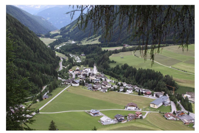
Tourismusinformation Kals am Großglockner