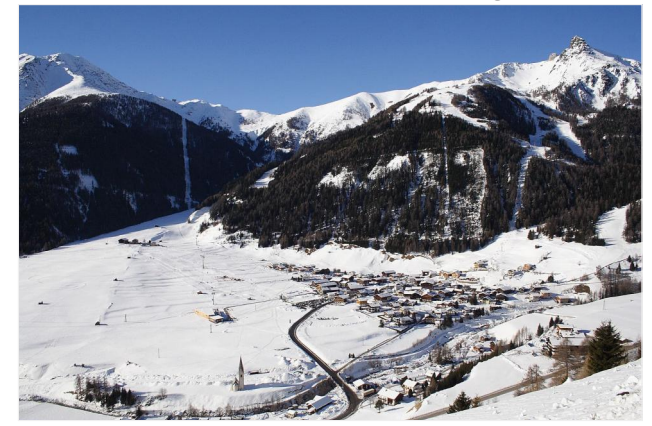
Tourismusinformation Kals am Großglockner