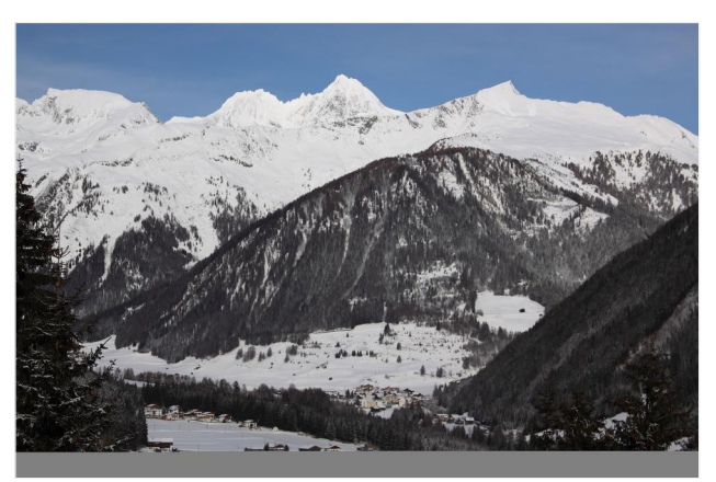
Tourismusinformation Kals am Großglockner