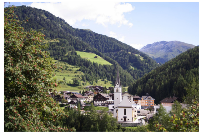
Tourismusinformation Kals am Großglockner