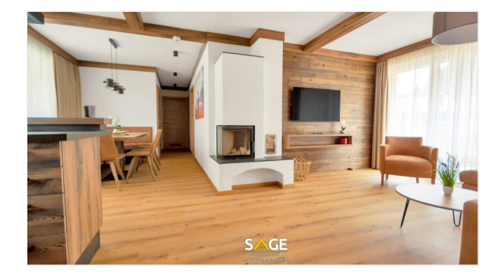
Beispielfoto Wohnen die "Grandiose"