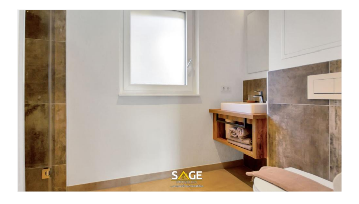
Beispielfoto Badezimmer 2