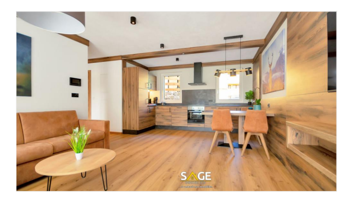
Beispielfoto Wohnen 2