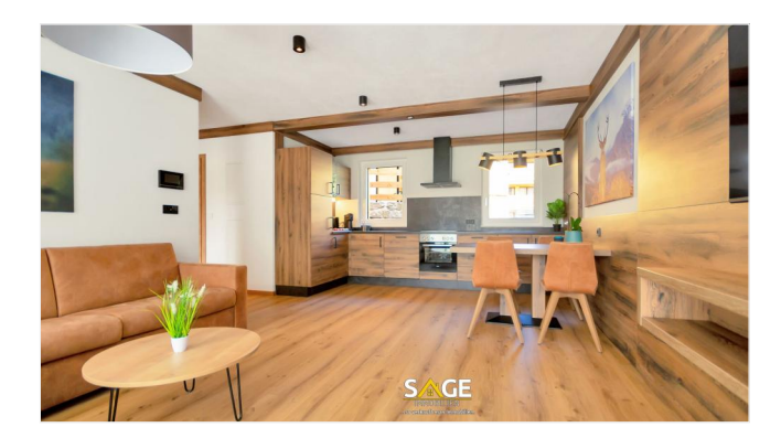
Beispielfoto Wohnen 2