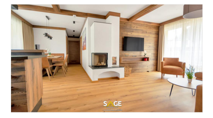
Beispielfoto Wohnen die "Grandiose"