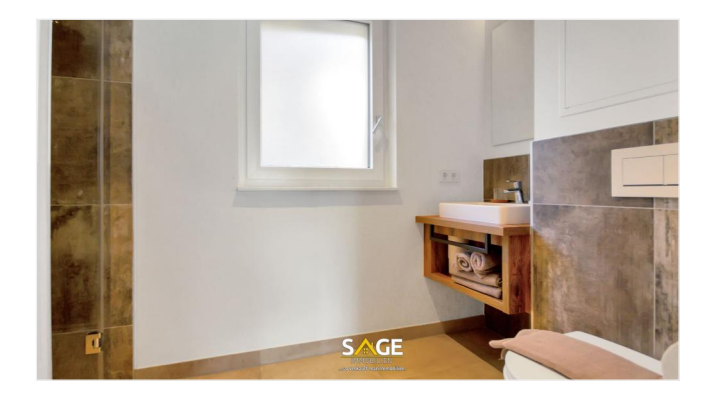
Beispielfoto Badezimmer 2