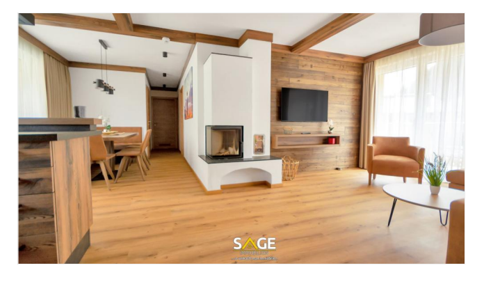
Wohn- und Essbereich (Bsp.)