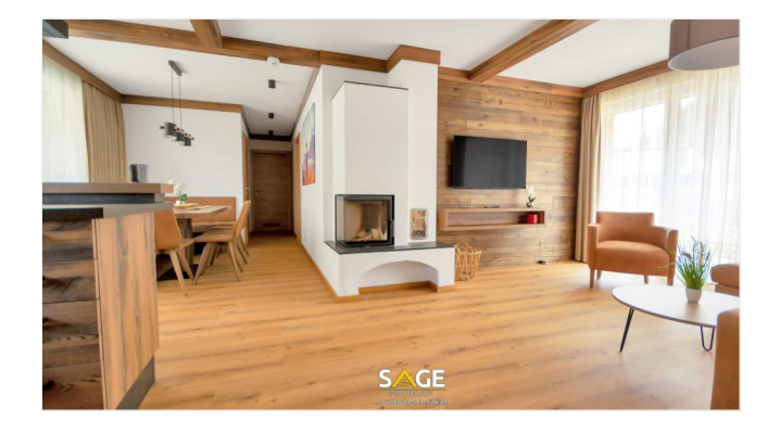
Beispielfoto Wohnen die "Grandiose"