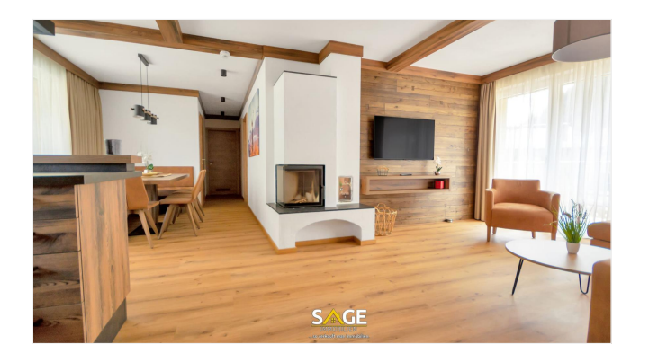
Wohn- und Essbereich