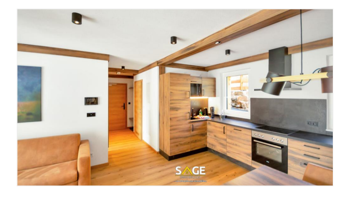
Beispielfoto Wohnen 3