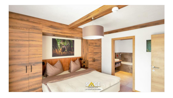
Beispielfoto Schlafen 2