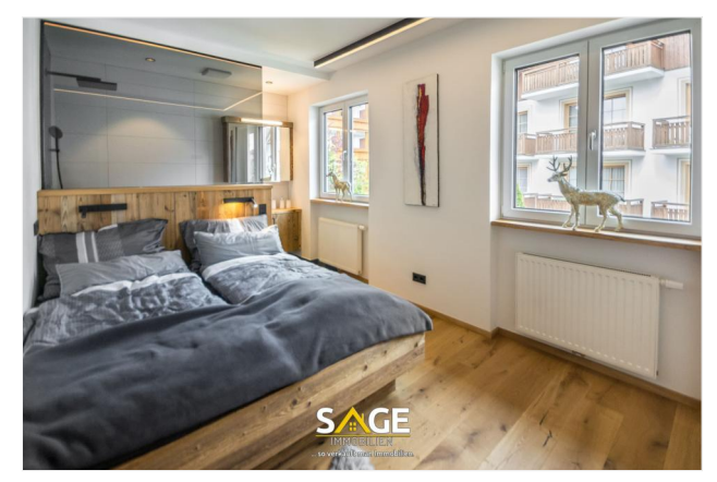
Schlafzimmer mit Bad en Suite