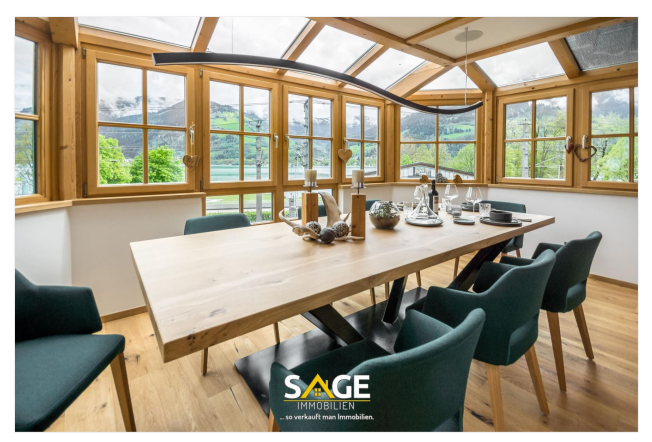
Wohnung Zell am See