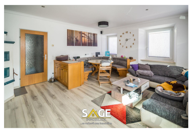
Wohnung in St. Michael