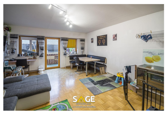
Wohnung in St. Michael