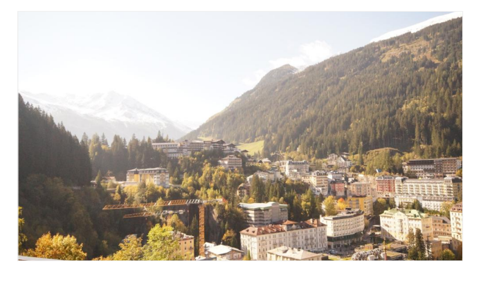
Blick aus dem Wintergarten