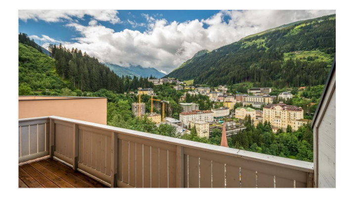
Blick auf Gastein