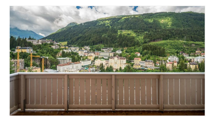
Blick auf Gastein