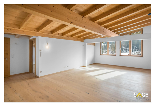
Top 14 WEB